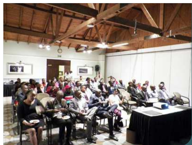
Attentive attendees at the investment talk