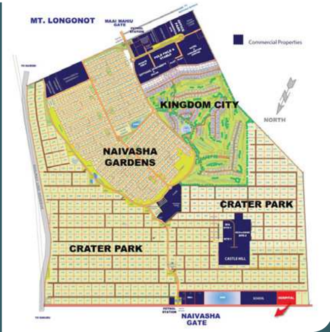
Proposed commercial sites with the hospital site highlighted