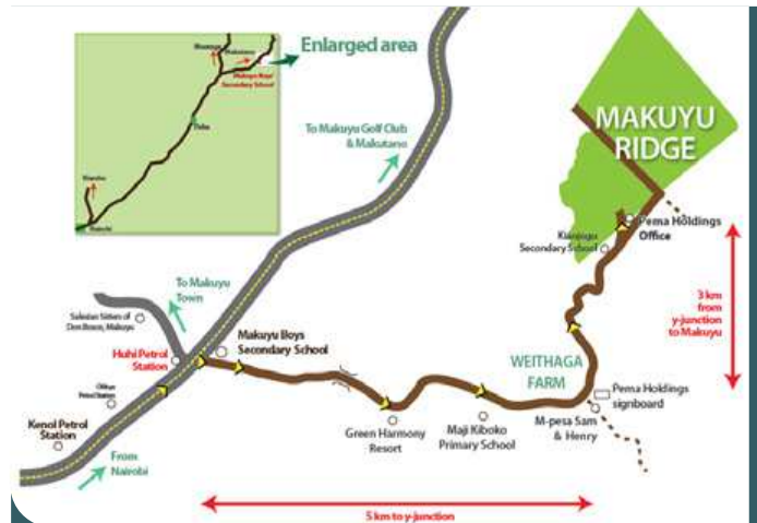
How to get to Makuyu Ridge