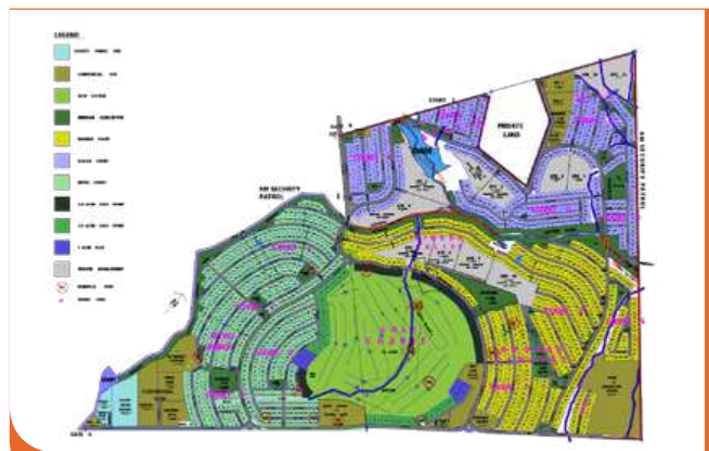
Master plan of Makuyu Ridge

There shall be integrated commercial and socio – facilities that will include the following:-