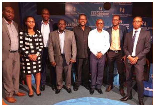
Senior members of staff with the chairman t the Nation Leadership Forum

These products are applicable to both our sites i.e Makuyu Ridge and Longo not Gate. Please feel free to contact us on the same.